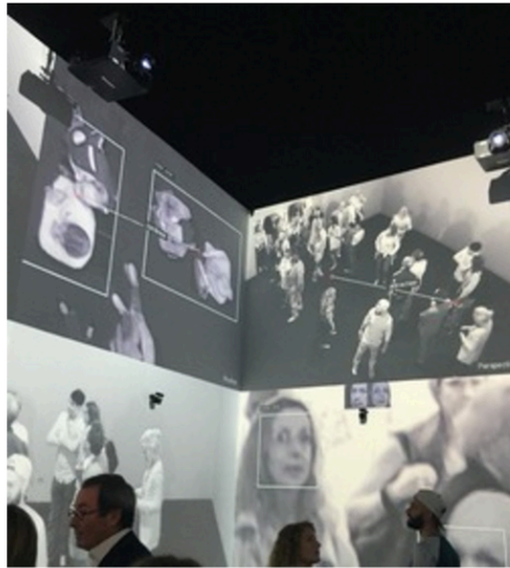
Rafael Lozano-Hemmer, Zoom Pavilion (2015).