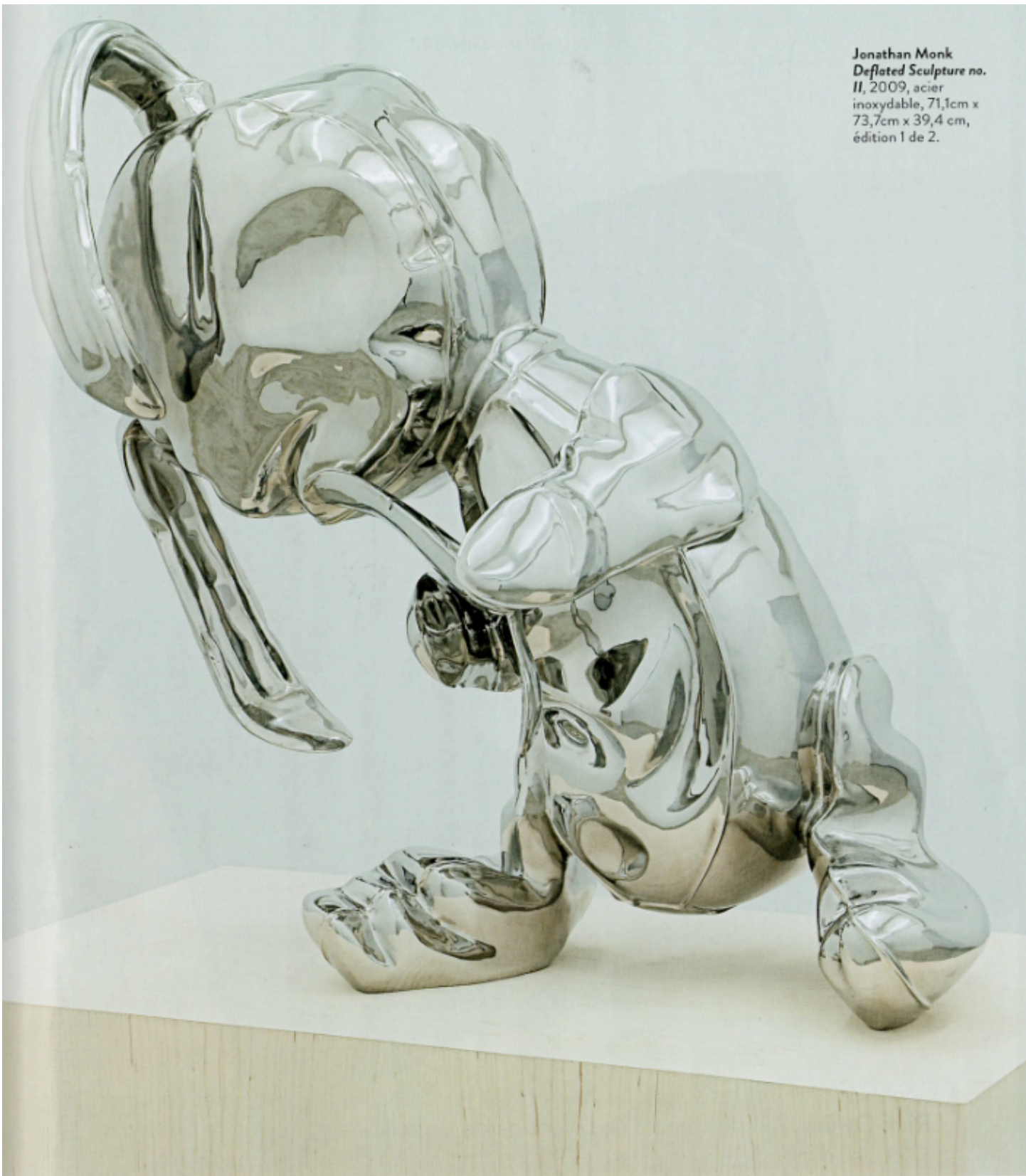
Jonathan Monk Deflated Sculpture no. II , 2009, acier inoxydable, 71,1cm x 73,7cm x 39,4 cm, édition 1 de 2.