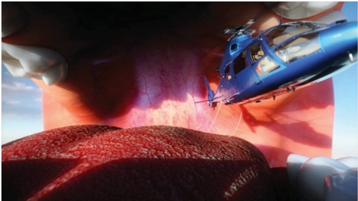
Darren Bader, video file (BTD), 3min, 52 sec, edition of 3 + a/p.

remain anonymous, said that most of his fellow gallerists felt the need to take a sharp breath inside the interactive pavilion so that their stomachs “looked tight and they looked suitably buff”. Our advice: skip the second helping of bratwurst, suck in your gut and get ready for your Basel close-up.