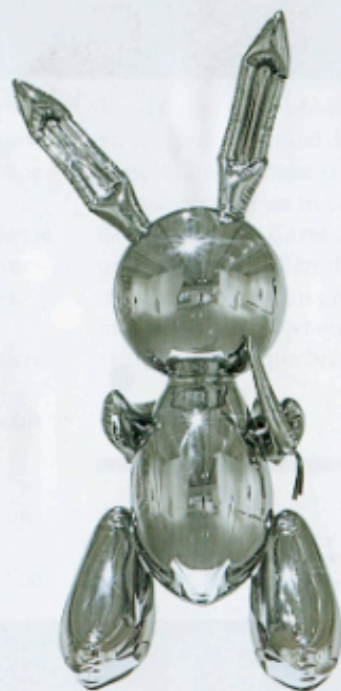
Jeff Koons, Rabbit , 1986, acier inoxydable, 104,1 x 48,3 x 30,5 cm, édition de 3 exemplaires et 1 épreuve d'artiste.

Lorsque j'ai exposé cinq de ces œuvres dégonflées chez Casey Kaplan à New York en mai 2009, Jeff Koons est venu et a écrit dans le livre d'or : "Exactement comme les miens", ce qui m'a fait plaisir.